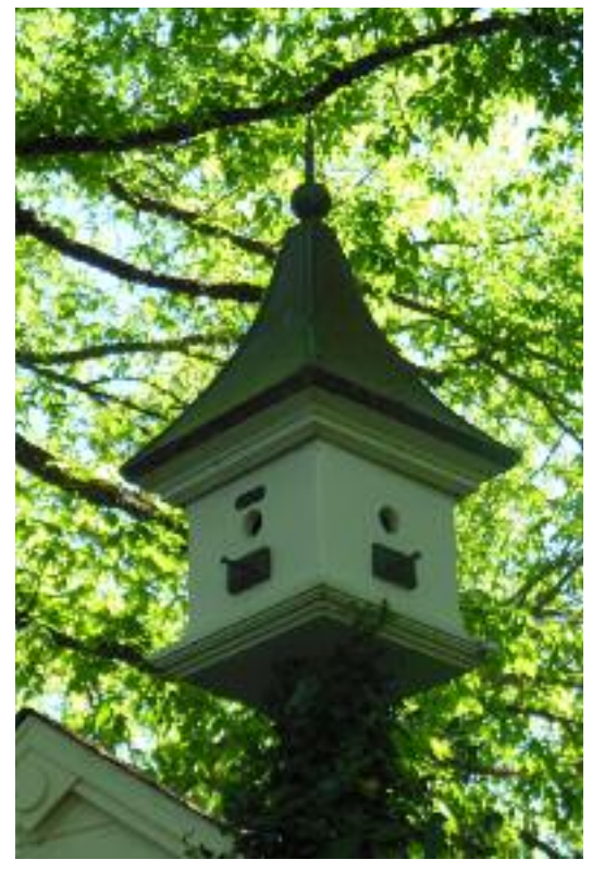
This is a cozy and safe nesting place for our feathered friends.