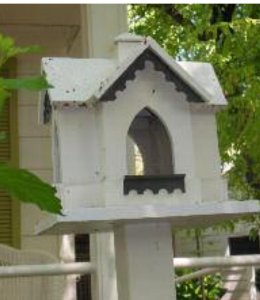
A favorite birdhouse

The appeal of birds in our backyards is immeasurable. While watching their antics and enjoying their beautiful plumage as well as their melodious song is intriguing, the grand dividend for gardeners is their free assistance as garden helpers. Birds are constantly turning over leaves, scratching in mulch, or flitting from bush to tree finding their meal of insects we never see. Birds such as flycatchers and swallows decimate flying pests. Seed-eating birds will glean 95 percent of the weed seed that grows every season. When we welcome birds to our backyards, we are creating a home landscape that will naturally ward off diseases and pests. Bacteria and spores struggle to survive as our gardens become more organic creating a natural balance between pests and plants. ... continued on page D14